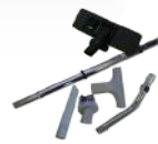
Tool Kit #1 Code: 28631