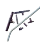
Tool Kit #3 Code: 28633